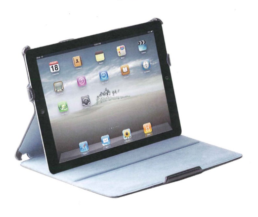
A short introduction to some of the tips and tricks for using your iPad to its fullest. This is a free class but registration is required.

Mother's Day Gift Saturday, May 3rd 1:00 p.m. Ages 10+