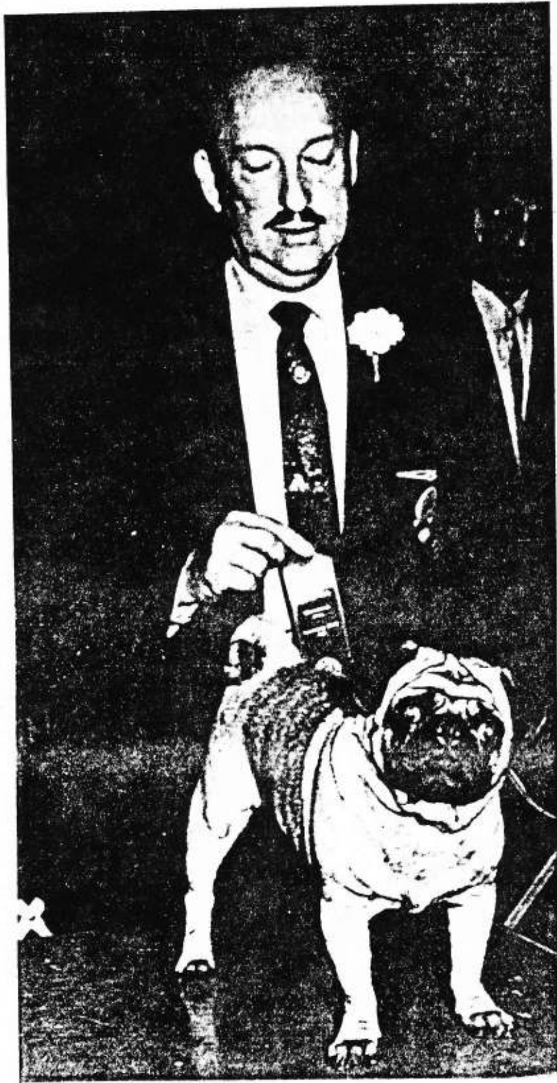
Pug Dog and Judge, at a Dog Show